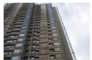
CURTAIN WALL CLEANING